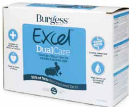
Excel DualCare - nuggets that can be syringe fed

The most important thing is to get your rabbit eating