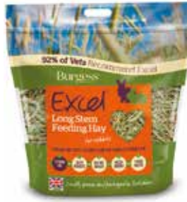
Burgess Excel Long Stem Feeding Hay

Never change your rabbits' mix or pellets suddenly. Abrupt changes can trigger fatal digestive upsets: rabbits use bacteria in their gut to help digest food and sudden dietary changes can disrupt the population of these "friendly" bacteria. Baby rabbits and those changing home or prone to other stresses are particularly vulnerable: take at least 1-2 weeks to change over to a new food and maintain unlimited hay at all times.